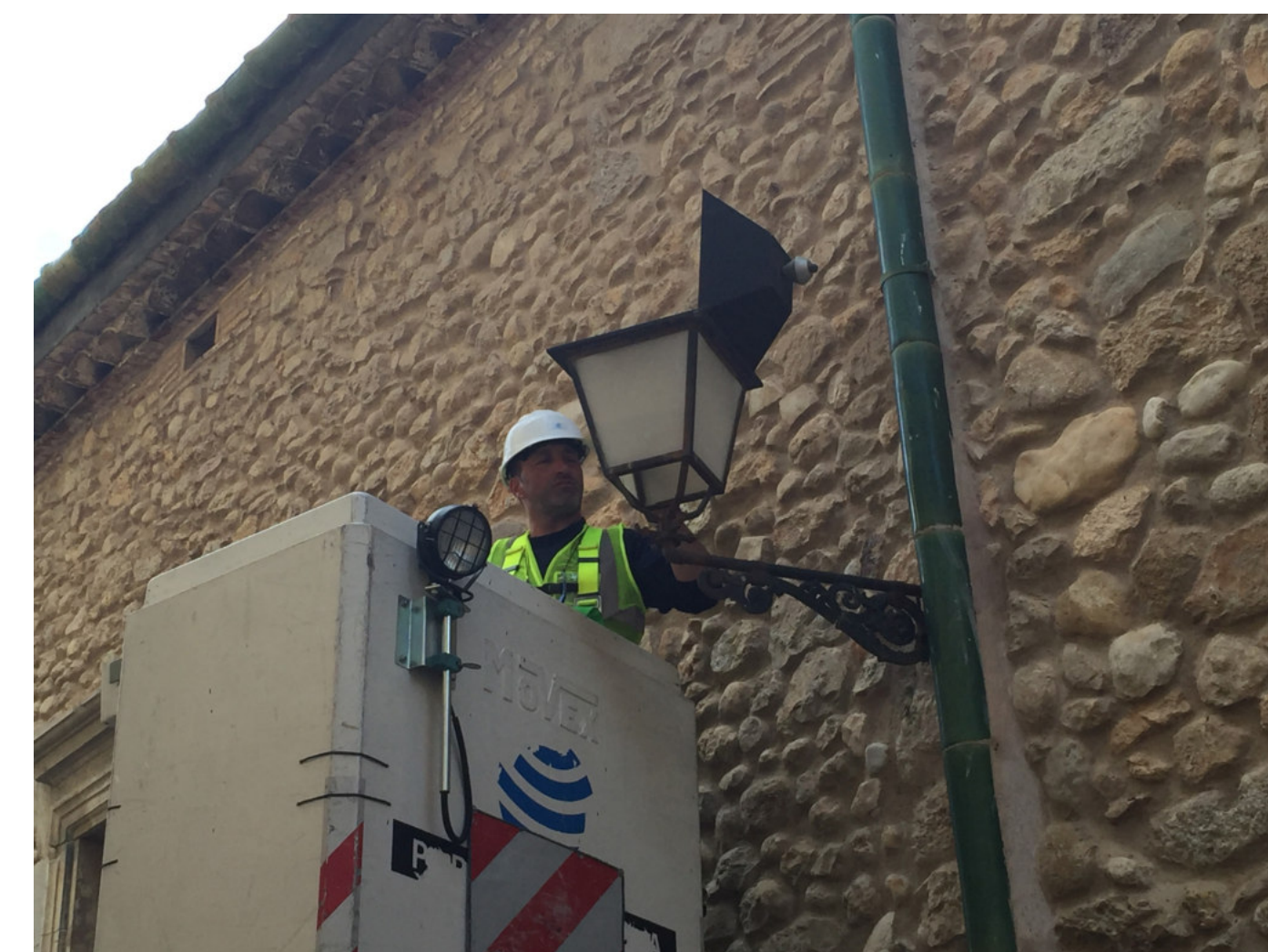
Streetlight Project / Beenergi

To achieve those objectives a wide array of solutions are being used since the programme started operations in May 2015 through the launch of sustainable energy investments to strengthen innovative organizational models and establishing and promoting new funding schemes such as the bundled tendering, Capacity building among all key stakeholders involved and final beneficiaries is also considered. Especially for local energy sector SME (maintainers, energy suppliers) since the Beenergi programme encourages contracts between municipalities and energy service companies (ESCO) or micro, small and medium energy service companies (MESCO).