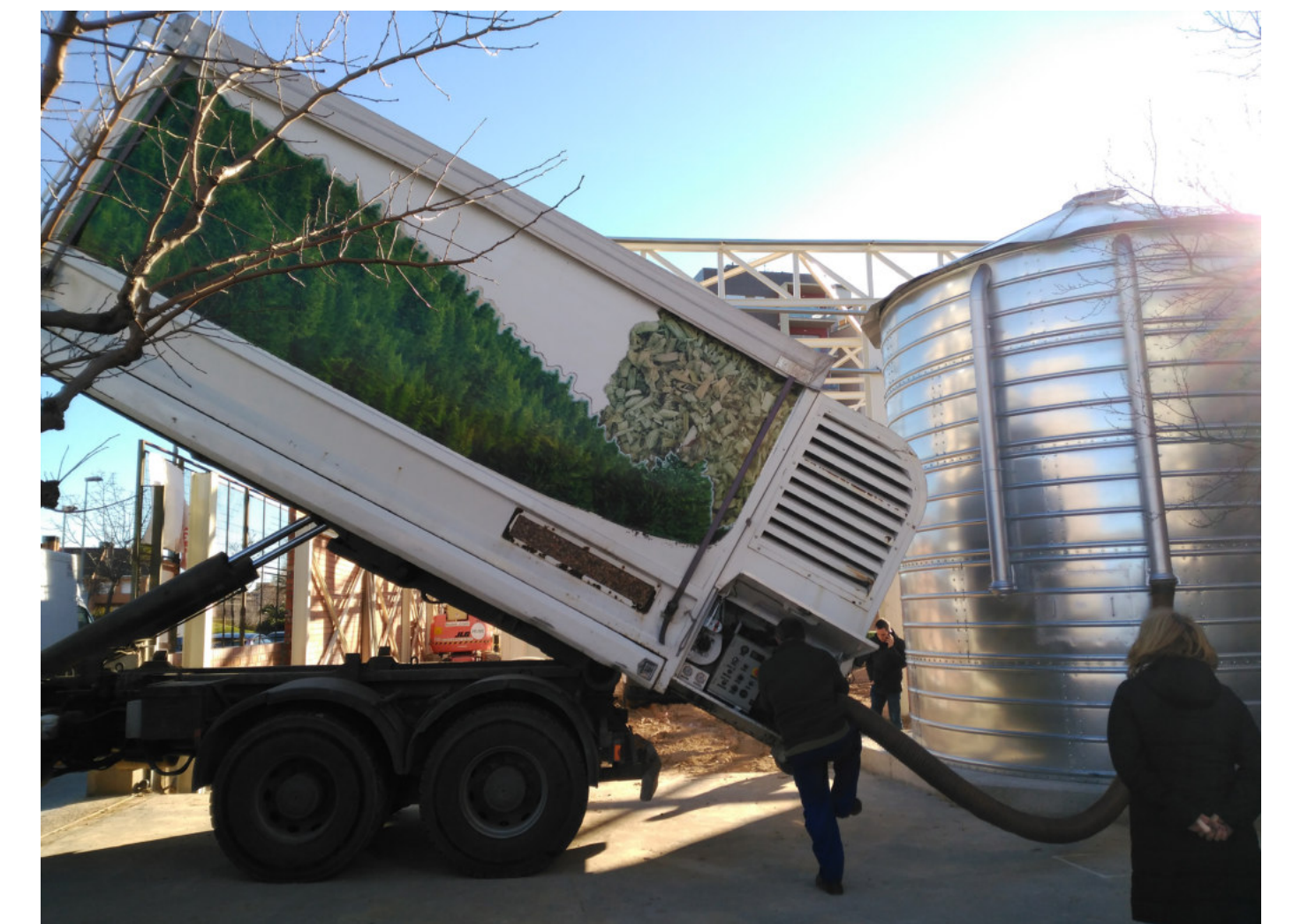
Biomass project / Beenergi